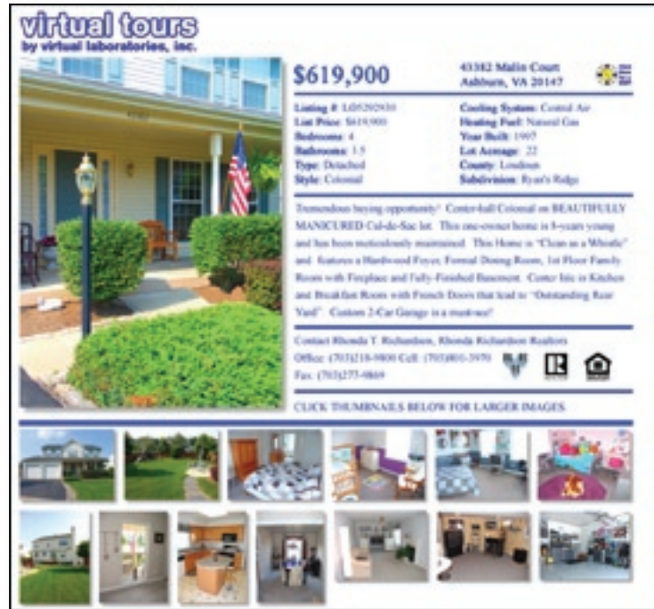
Custom Listing Website Impress sellers and encourage buyers with stunning photos, listing details, maps, and your contact information on a professionally produced website.