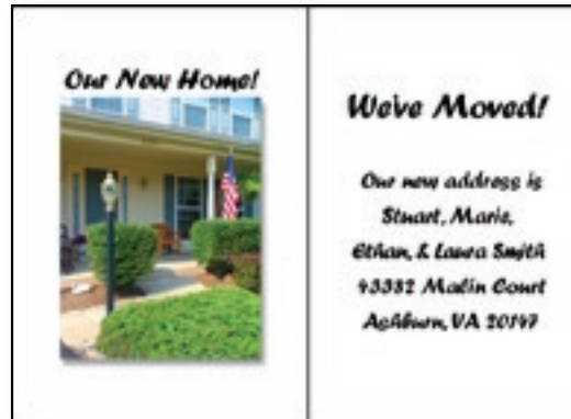
Housewarming Gift "We've Moved!" Cards Give your buyers a gift they'll love. Because nothing says REFERRAL like a happy client.