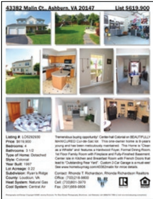
Custom Listing Brochure Prospective buyers will remember your listing when they take home a beautiful, double-sided brochure.