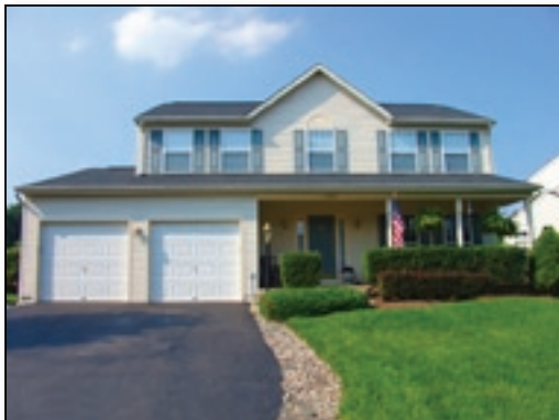
Professional Photography Make a great first impression on the MRIS and all of your listing materials.