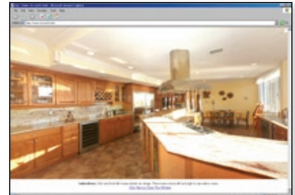
High-Definition Virtual Tours (HDVT) Buyers and sellers love panoramic, full-screen, high definition virtual tours!